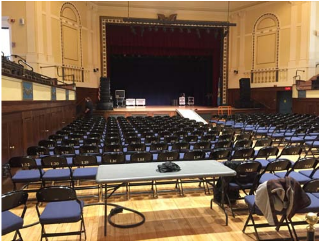
View from house left FOH position